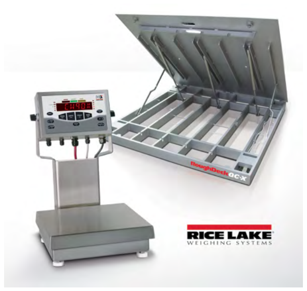
MotoWeigh<sup>®</sup> in-motion checkweigher, CW-90X washdown checkweighing bench scale and RoughDeck<sup>®</sup> QC-X

Foodborne illness became an issue of public health in the early 2000s, enabling the FDA to set higher preventative standards for food safety and elicit enforcement agencies to hold companies