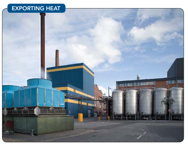
Figure 2. Grinsted plant in Denmark no longer rejects surplus heat but instead sends it to a district heating company.

Meanwhile, the company's Mons, Belgium, polymer chemistry plant is saving energy thanks to a new two-step incinerator with an extra unit to reduce NO_x emissions to below the level achieved with standard units, and a wireless sensing system to monitor and control storage tank temperatures. The incinerator is expected to cut NO_x emissions by 80% to 20 tons/yr while the improved control enabled by the sensors has significantly decreased steam consumption. "The accumulated energy savings from these two investments is expected to be \rm 690,000/yr\ [\$101,000/yr\ ], " notes Nieuwenhuizen.