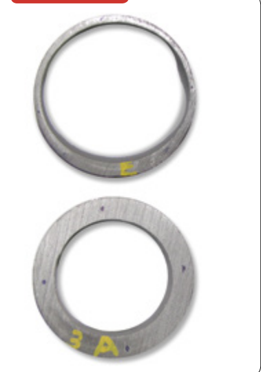
Fig. 2. Single-phase FAC caused the substantial wall thinning shown.

the reducing environment causes iron ions to leach out of the steel/magnetite matrix, resulting in the wall thinning. Temperature and pH affect the extent of the dissolution; it usually reaches a peak at a temperature of about 150°C and increases with lower pH (e.g., 9 and below).