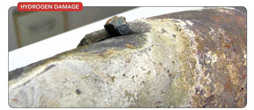
Figure 1. Hydrogen gas molecules penetrate into the metal wall — notice the thick-lipped failure here.

Impurities cause corrosion, scaling and other problems. These become more severe as boiler pressures and temperatures increase. Fortunately, the power industry has learned some lessons that directly apply to chemical plants, particularly ones that generate high-pressure steam for process needs or electrical generation. For example, Tables 1 and 2 summarize guidelines developed by the Electric Power Research Institute (EPRI) for makeup water effluent and condensate