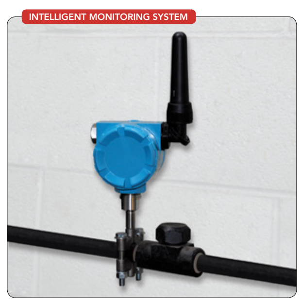
Figure 2. Non-intrusive intelligent monitoring systems can provide immediate notification of faulty steam traps while pinpointing the exact location and nature of the failure.